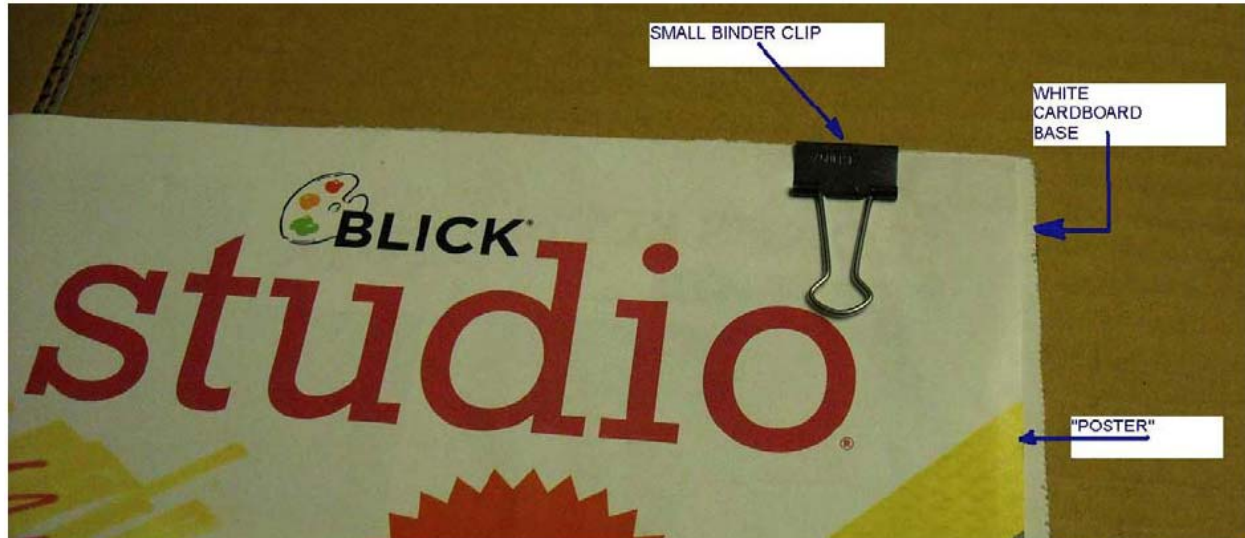
Figure 2: Small binder clips can be used to attach the poster to the cardboard panel, at the top.

Note: In Figures 2 and 3, the piece of paper that reads "BLICK Studio..." is playing the role of your poster.